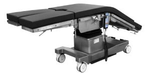
Back Plate Down 0°-20°