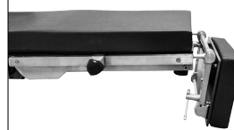
Head Plate Down 0°-90°