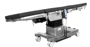
Lateral Tilt Right 0°-15°