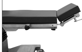
Head Plate Up 0°-40°