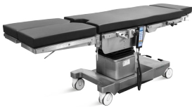
Lowest Position of Table Top 710mm