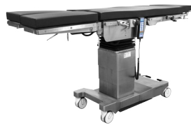
Highest Position of Table Top 1010mm