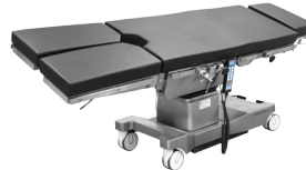
Lateral Tilt Left 0°-15°