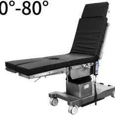
Back Plate Up 0°-80°