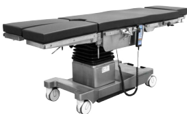
Horizontal Sliding 350mm