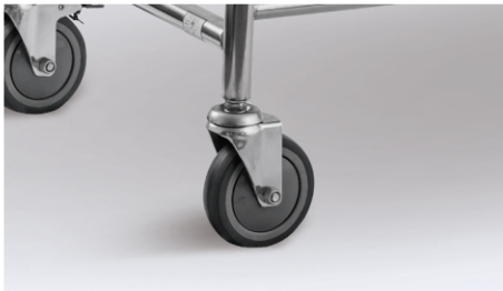
5silence caster. Advanced protection universal brake wheel, easy to move, simple to operate, reliable performance