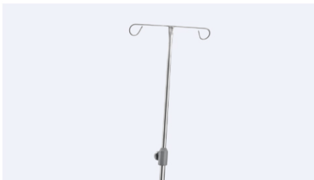
Adjustable stainless steel I.V. pole, outside diameter \Phi 19*1, inside diameter \Phi 16*1, telescoping scope 750mm, load capacity: 15KG