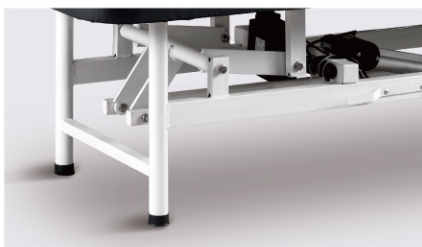
1.2-1.5 mm Thickness powder coated steel frame, 250 kg bear loading