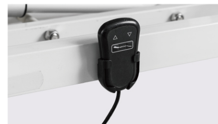
Hand controller, keep qualified after 2000 times use