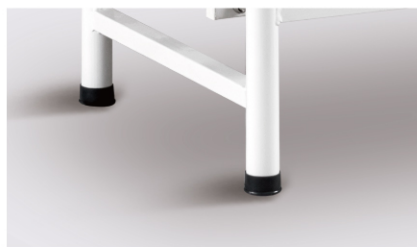
4 pcs Anti-slip bed feet covers