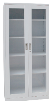
Instrument Cabinet SKH052 Size: 900*400*1800mm