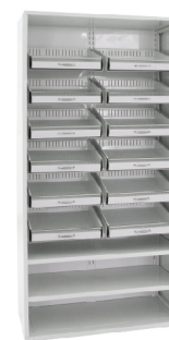
Adjustable Component Medicine Shelf SKH061 Size: 1030*500*2000mm