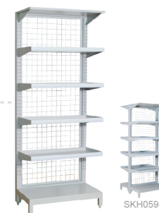
Single-sided Storeroom Medicine Shelf SKH059 Size: 800*460*2000mm