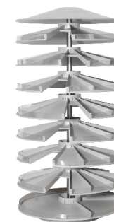
Rotary Medicine Shelf SKH060 Size: φ920*1800mm