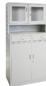
Medicine Cabinet SKH054 Size: 900*500/300*1800mm