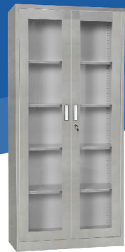
Instrument Cabinet SKH050 Size: 900*400*1800mm