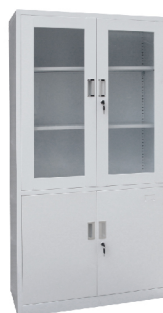
Instrument Cabinet SKH050 Size: 900*400*1800mm