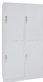
Four-door Wardrobe SKH058-5 Size: 900*450*1800mm