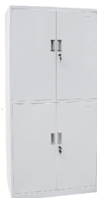
Four-door Wardrobe SKH058 Size: 900*450*1800mm