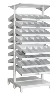
Two-sided Adjustable Medicine Tray SKH062 Size: 800*800*2000mm