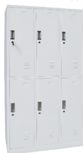
Six-gateway Cabinet SKH056 Size: 900*450*1800mm