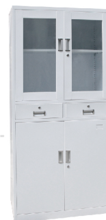
Instrument Cabinet SKH051 Size: 900*400*1800mm