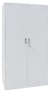
Medicine Cabinet SKH053 Size: 900*400*1800mm